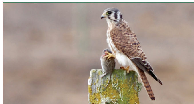
Female American Kestrel

Moderate rain will cancel. It can be windy, so layer up to keep warm. Info: 707 526-5883.