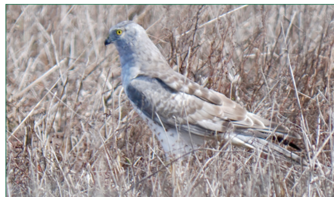
Male Northern Harrier